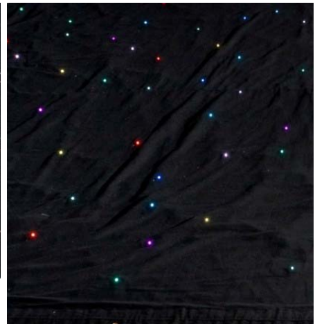
RGB LED Stardrop Curtains