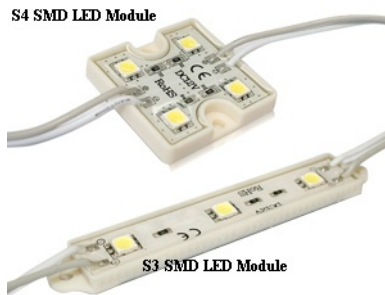
S4 SMD LED Module