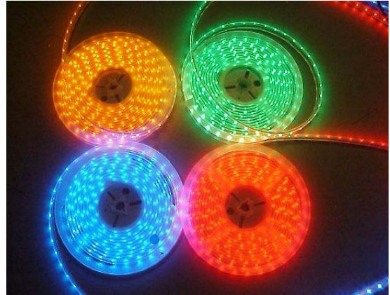
Single Color LED Flat Ribbon

Pure White 5m length, 14.4W/M, 120° Beam Angle, Warm White 12VDC 5m length, 14.4W/M, 120° Beam Angle, 12VDC