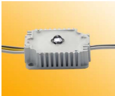
X1 SMD LED Module - 120°