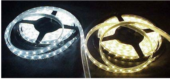
Pure and Warm White LED Ribbon