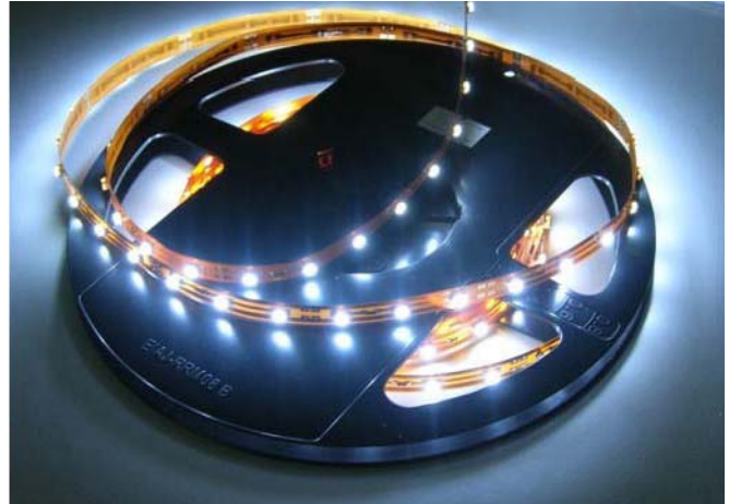
SMD LED Flexible Ribbon